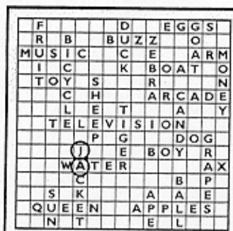
Example 1B: ...but decides to cover both the J and the A in JACKET, instead.