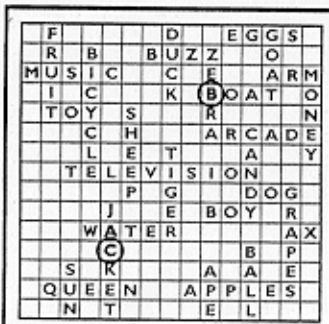
Example 2B: ...but decides to start BOAT by covering the B, and continue JACKET by covering the C.