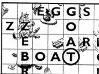
Example 4: If you cover the T to complete BOAT and GOAT, collect two scoring chips!